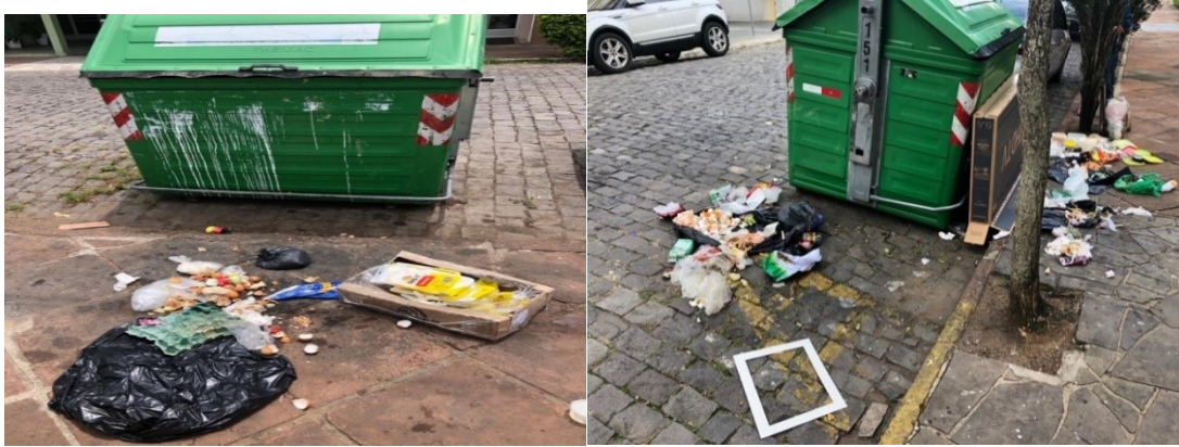
Figure 02: Waste disposal outside organic waste collection containers

The municipality's Collectors and Recyclers Cooperative (COOMCAT) explained that they are responsible for solidary collection in the central area and in some neighborhoods, but warned that in the city, there are many recycler, clandestine collectors, who collect only what interests them to market. In most of the cases, they rip the bags and leave the rest spread on the floor as shown in the images in figures 02 and 03 below.