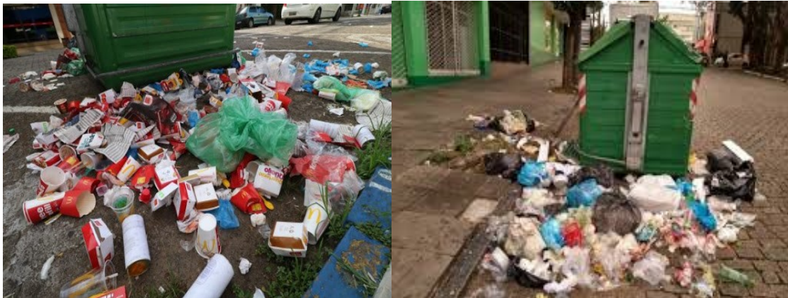
Figure 03: Waste disposal outside organic waste collection containers